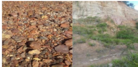
Figure 1. Deposit of laterite stone in Berau district, Indonesia.