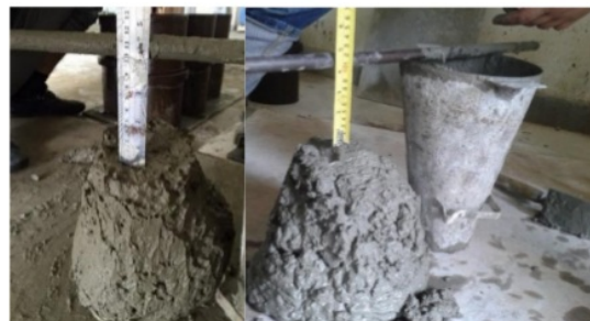
(a) Laterite stone

The result of the slump test of laterite stone and river stone as coarse aggregate to produce concrete can be seen in figure 2. Fresh concrete had a slump value of 10 cm and 9 cm of laterite stone and river stone as coarse aggregate, respectively, with met the slump design of 10 \pm 2.5 cm. Visual observation showed that fresh paste made with tap water and PCC could maintain the workability and homogeneity of the mixture without segregation and bleeding occurred.