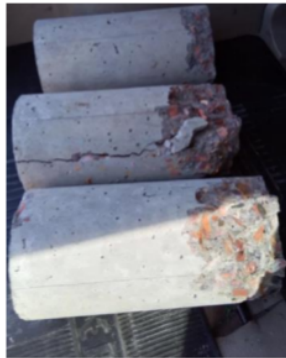
Figure 4. Section of concrete after compressive strength test.