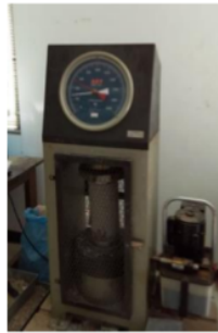
Figure 3. Compressive strength test.